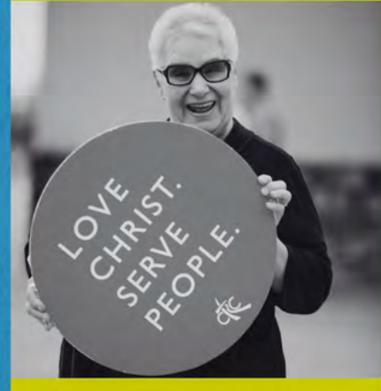
DECEMBER 8TH BIG GIVE SUNDAY