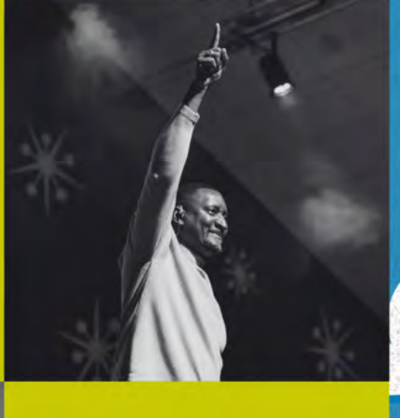
NOVEMBER 3RD COMMITMENT SUNDAY